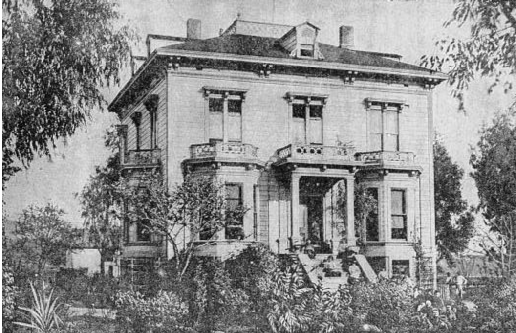
Figure 1. The Beckwith House, 1886. This building served as a home for elderly, lower-income women and indigent, working-class children from 1873 to 1882, when the Ladies' Relief Society opened a separate, purpose-built "Home for Aged Women." A close look shows the matron standing in the doorway and children gathered on the front steps and around the house.