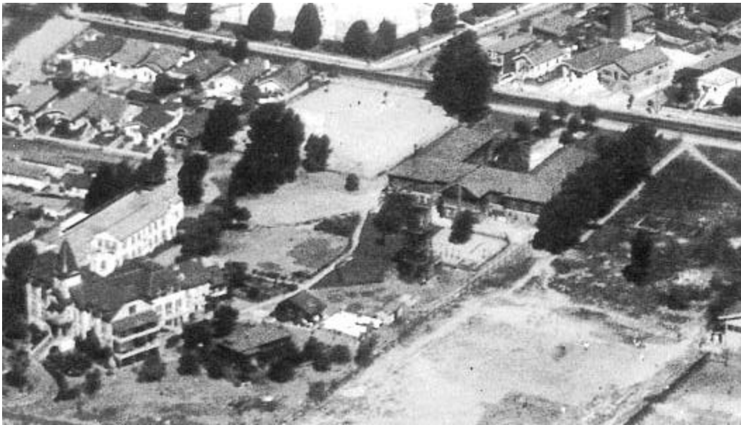
Figure 3. The Children's Home, c. 1925. The main entry of the Children's Home faced 45 th Street after it was rebuilt in 1906. The "new" Babies' Home, completed in 1925, is next to the Home for Aged Women, erected in the early 1880s.