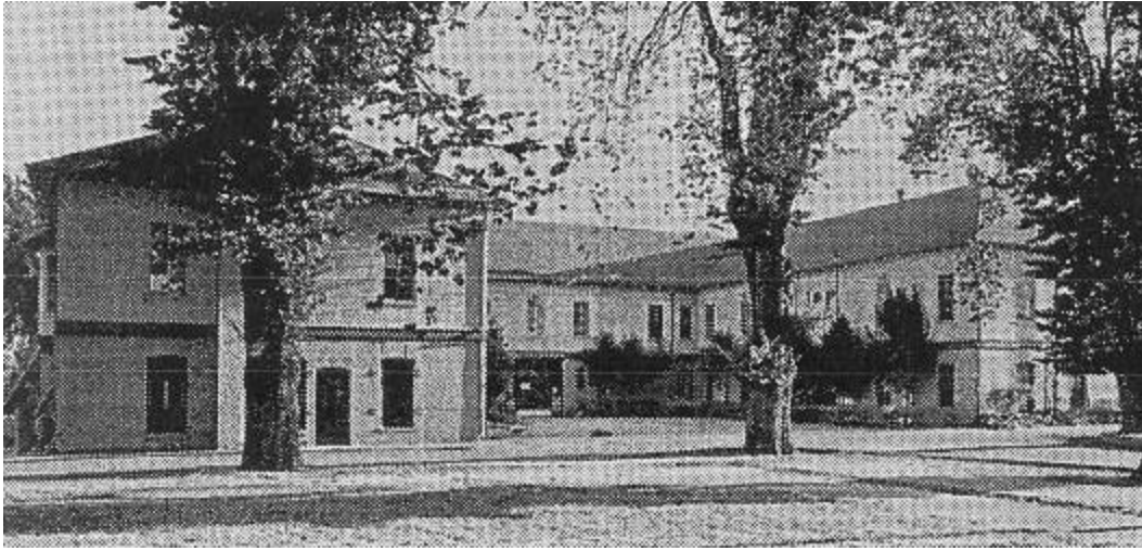
Figure 4. Studio One Arts Center, 1990s. This picture shows the courtyard of the former orphanage and the building's clear relationship to 45 th Street. The orphanage was turned into a public arts and recreation center in 1949. Use courtesy of the Friends of Studio One.